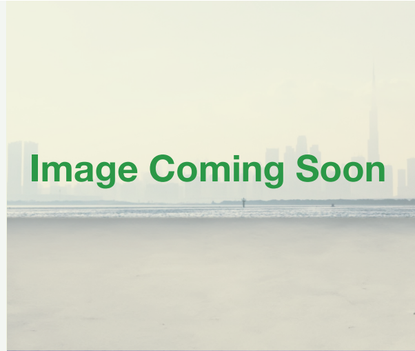
Image Coming Soon